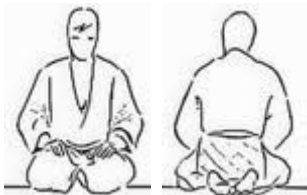
Sitting in Seiza (formal sitting posture)

Before class officially begins, use this time on the mat to stretch, warm-up and prepare for training. Your instructor will signal when class begins with two loud claps. Once you hear this signal you should line up in seiza (see below) facing the shomen and await instruction. Classes will usually begin with a senior student or the instructor leading everyone in a stretching/warm-up routine followed by formally bowing in to start training.